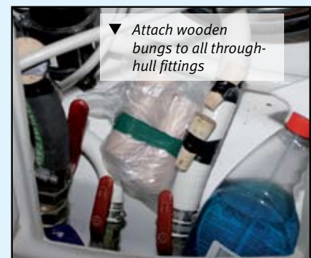
▼ Attach wooden bungs to all through-hull fittings

10. Softwood Plugs for Hull Fittings: these were often missing, or not secured to the relevant through hull fitting.