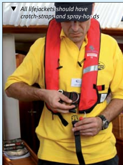
▼ All lifejackets should have crotch-straps and spray-hoods

7. EPIRBs: often skippers did not know how to test their EPIRB; several were found with faults and had to be replaced.