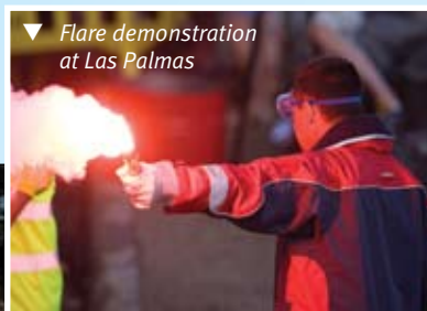
▼ Flare demonstration at Las Palmas

Remember the Safety Equipment compliance check is intended to be an assistance to the skipper and crew and does not remove his or