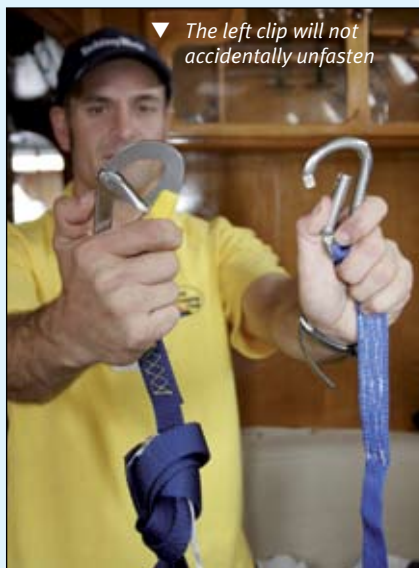
▼ The left clip will not accidentally unfasten