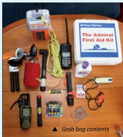
▲ Grab bag contents

3. Man Overboard Equipment: not having the correct combination of MOB equipment and particularly not having the required whistles, drogues, reflective tape fitted were common failures.