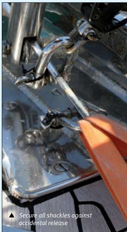
▲ Secure all shackles against accidental release

8. Guardrails: split rings missing from guardrails were quite a common failure.