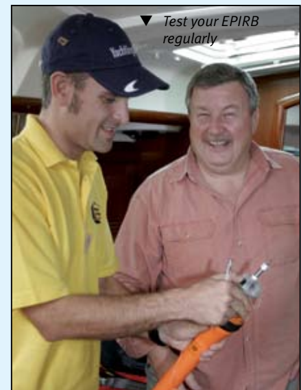
▼ Test your EPIRB regularly

2. Jackstays: attachment shackles were not seized with wire/cable ties (one inspector found 5 jackstays with very loose pins, just ready to fall out); jackstays well beyond their useful life due to abrasion and UV damage