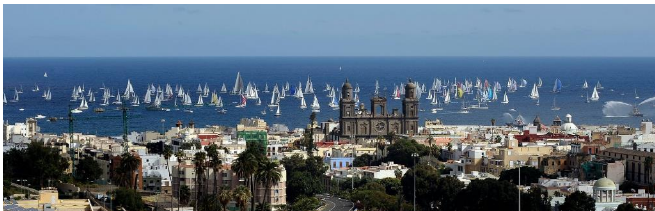
The spectacular annual start of the ARC from Las Palmas, Gran Canaria

Any highly motivated young people seeking a thrilling and truly life-changing experience as part of an integral and dedicated team are invited to apply for this unique opportunity