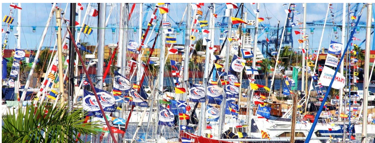
Being a part of the ARC is also about sharing an adventure and dream with hundreds of other like-minded people from all over the world

Successful applicants will be encouraged to raise some additional charitable funds within their local communities, and / or amongst their friends and families to allow them to share some of the responsibility and commitment of their voyage, and take a level of personal pride in their achievement. 100% of the funds raised in this way will go towards funding personal costs that are specifically associated to them as an individual, such as the items listed above in the section 'what's not included?' The overall intention therefore, is that crews will not personally incur any costs for the duration of their time away.