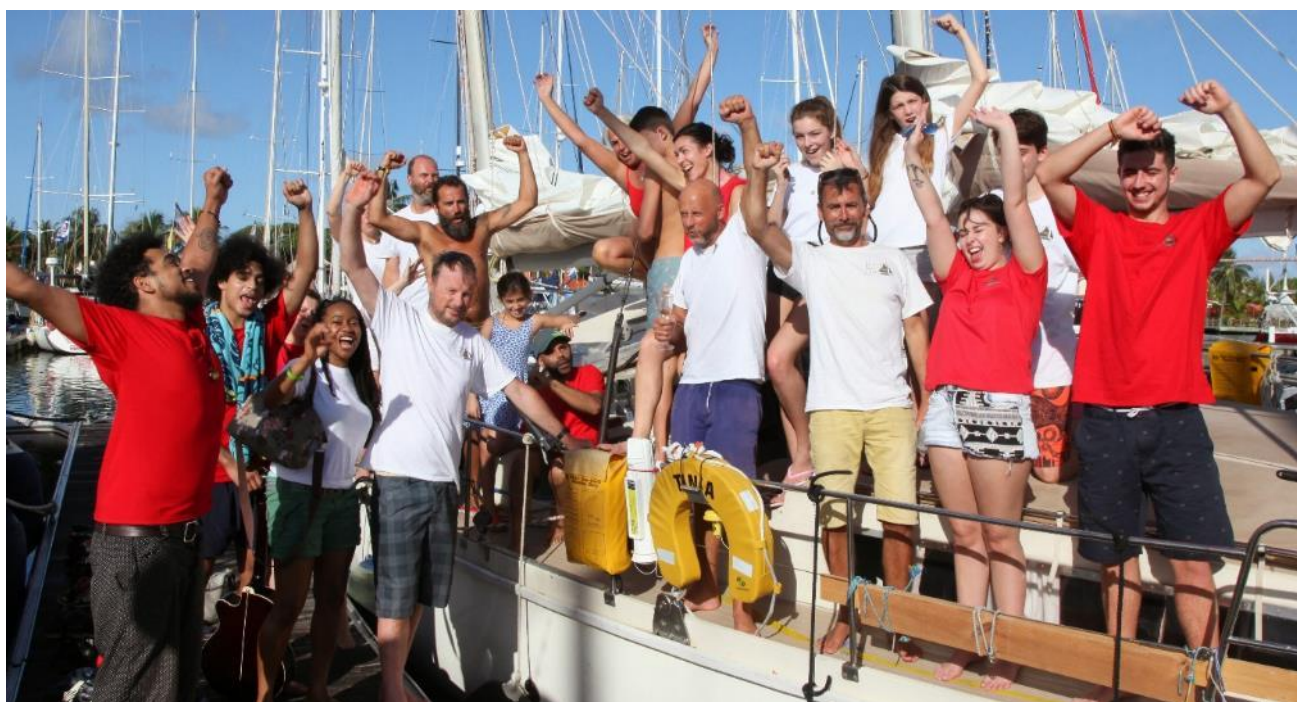
Arriving in Saint Lucia having completed the 2,700nm Atlantic crossing is an incredible feeling of achievement for all the ARC crews