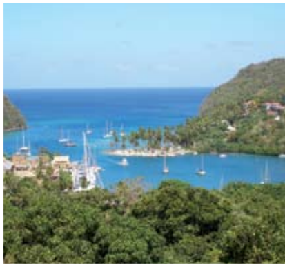
▲ A Caribbean jewel, Marigot Bay