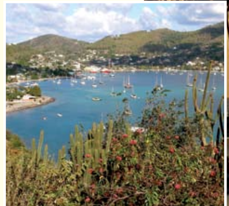
▲ The large Admiralty Bay, Bequia

Although lying just 10 miles south-east of Bequia the sail to Mustique can often be a slog to windward in turbulent seas, although a stop at Bequia's southern Friendship Bay breaks the trip. There are mandatory mooring buoys in Britannia Bay, the only anchorage allowed in Mustique, with a park fee. Make sure you