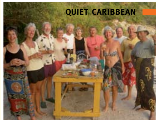
▲ The ubiquitous cruisers' 'pot luck'