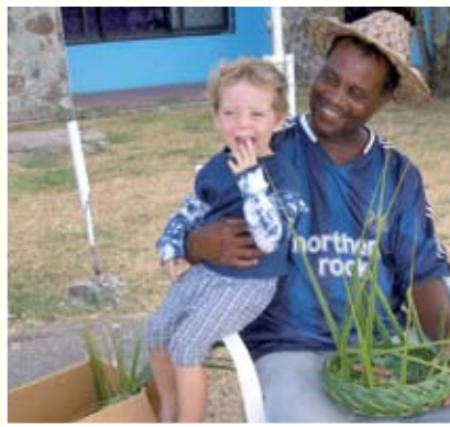
▲ Palm hats give good protection from the sun