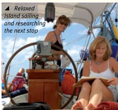
▲ Relaxed Island sailing and researching the next stop