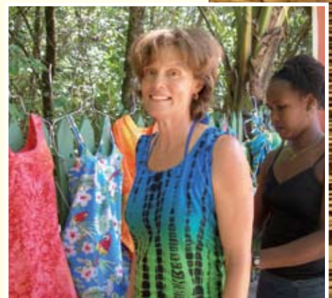
▲ Don't worry about clothing - there is plenty to buy!