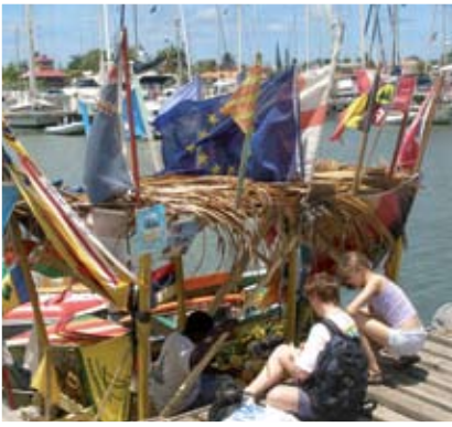
▲ An enterprising local brings produce to the yachts