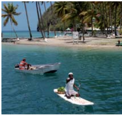
▲ 'Boat boys' arrive on varying craft. They are seldom aggressive these days but try creative pricing!