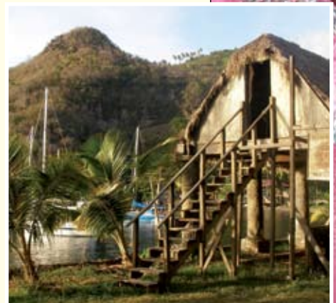
▲ In Wallilabou Bay, St Vincent the customs office is on the set of the 'Pirates of the Caribbean' films

(Porlamar 10°56.7'N 63°50W) The big, but shallow bay at Porlamar in duty free Margarita is popular with cruisers. Enterprising vendors will deliver fuel to your boat (Approx 1p per litre for diesel, 2p for petrol!). There have been some security issues in the outer bay.