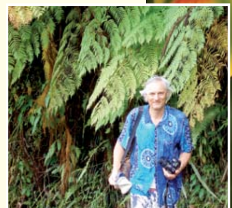
▲ St. Lucia is a stunning towering verdant island, it's worth taking time to explore