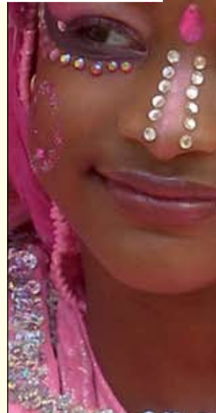
▲ The culture of carnival runs deep in Trinidad, special effort goes into the kids