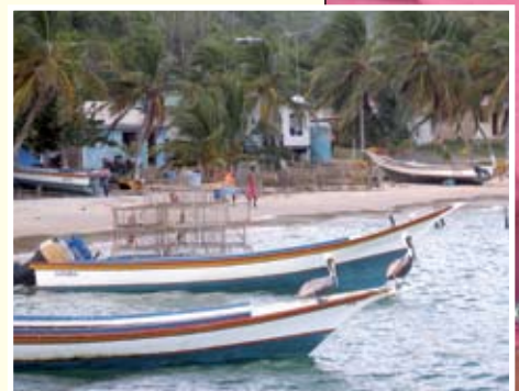
▲ The small village with customs office in Los Testigos, Venezuela