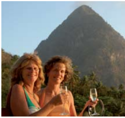
▲ Free champagne at the resort between the Pitons.