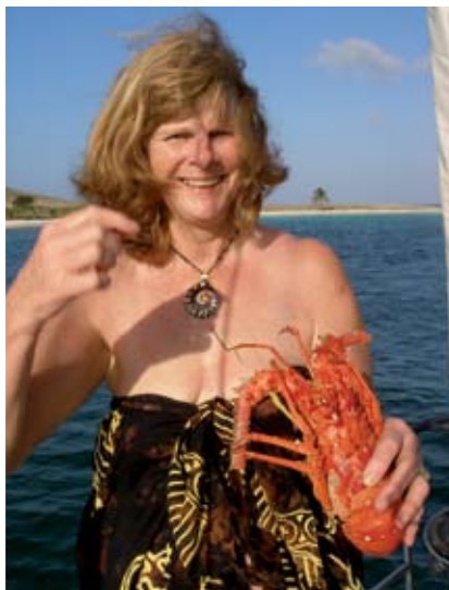
▲ A gift from the fishermen! Testigos, Venezuela