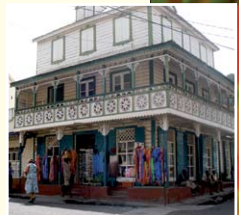
▲ Attractive Soufriere with its French creole buildings with gingerbread trim

Fourteen miles south of Carriacou lies the spectacular spice island of Grenada. Aromas of spices waft over the water from this mountainous, lush island