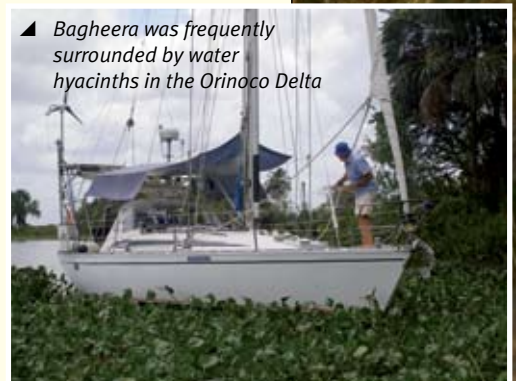
▲ Bagheera was frequently surrounded by water hyacinths in the Orinoco Delta