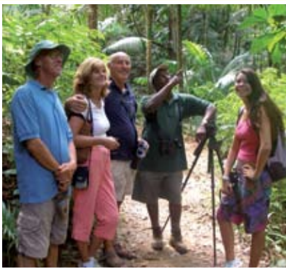
▲ A bird tour in Tobago, enjoying our guides powerful 'scope