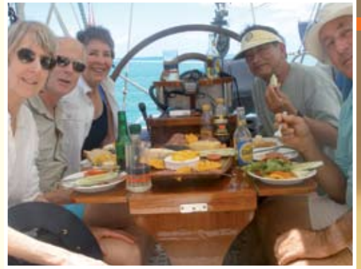
▲ Roughing it on board!

International airport is at the south end of the island at attractive Vieux Fort with direct flights to the UK.) Castries has an extensive market, particularly vibrant on Saturdays, good supermarkets and a few old buildings remain around the central Derek Walcott Square. Customs can be cleared in Castries but it is far easier in Rodney Bay and Marigot, especially when cruise ships visit.