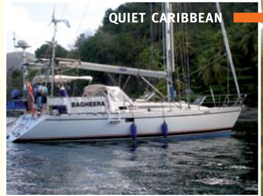
▲ Bagheera on a mooring buoy at Soufriere with great snorkelling closeby

avoid Montezuma's reef unlike the French cruise liner the Antilles in 1971. It was still on fire when I visited several months later.