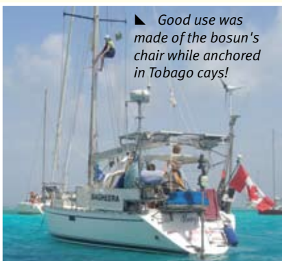
▲ Good use was made of the bosun's chair while anchored in Tobago bay!