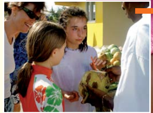
▲ Local markets are plentiful and locals full of information about how to eat their produce

that was aptly nicknamed the 'the banana bread island' by our 4-year old son after we completed the ARC in 1986. An interior hike in the rainforest is a must, cooling off in one of the many waterfalls or mountain streams and seeing the cultivation that supplies much of the island chain.